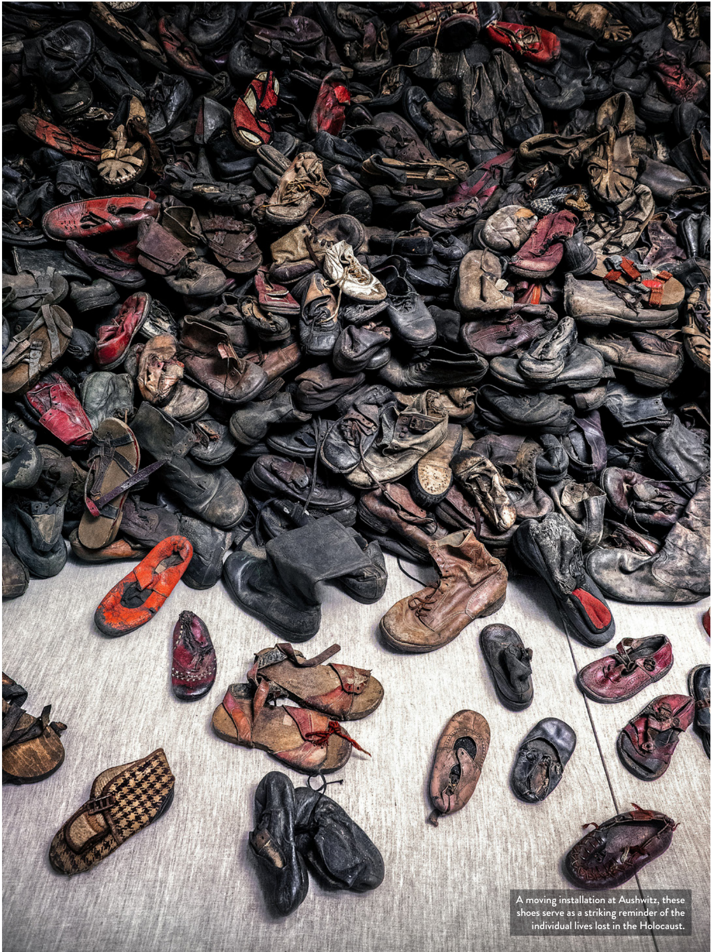
A moving installation at Aushwitz, these shoes serve as a striking reminder of the individual lives lost in the Holocaust.